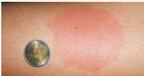
Excessive local reaction diameter over 5 cm (2 in)

If the tumor is still detectable, or if you are receiving chemotherapy or radiation therapy, the mistletoe therapy is continued without a break. In other cases, therapy breaks of increasing length are recommended, to avoid habituation. Mistletoe therapy is usually administered for several years.